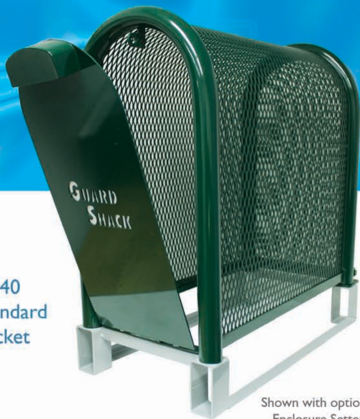
Shown with optional Enclosure Setter

For maximum security and easy installation the optional enclosure setter is available. Simply bolt the cage to the setter with the provided hardware, set in wet concrete and walk away!